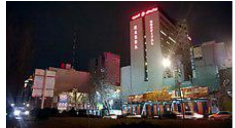
Kasra Hospital (pictured in 2016) was the place where Amini died.