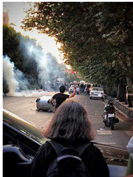
People protest against Amini's killing in Tehran's Keshavarz Blvd

Amini's beating and death caused widespread anger among several social networks. The hashtag #MahsaAmini became one of the most repeated hashtags on Persian Twitter. The number of tweets and retweets of these hashtags have exceeded 80 million. [102][103] Some Iranian women posted videos on social media of themselves cutting their hair in protest. [104] It was reported on 21 September that the Iranian government had blocked internet access to Instagram and WhatsApp and disrupted internet service in Kurdistan and other parts of Iran in an attempt to silence the unrest. [105] As of 24 September, the hashtag #Mahsa_Amini and its equivalent in Persian broke the Twitter record with more than 80 million