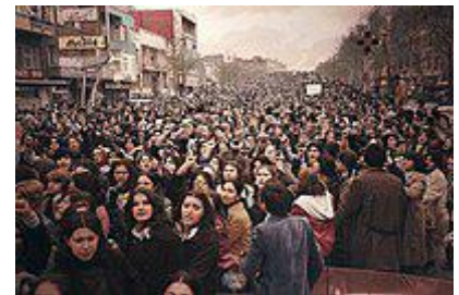
1979 Iranian Women Day's protests against mandatory hijab laws

Protests against the compulsory hijab have been common since 1979. One of the largest protests took place between 8 and 14 March 1979, beginning on International Women's Day , a day after hijab rules were introduced by the Islamic Republic. [19] Protests against mandatory hijab rules continued, such as during the