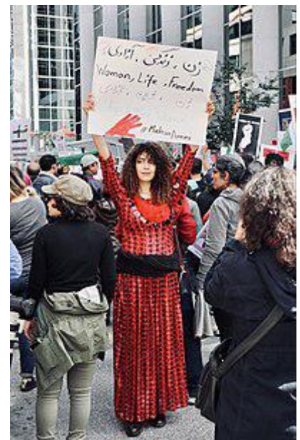
Protest in Ottawa, Canada