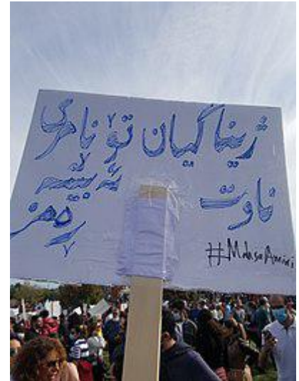
A sign in a protest in Toronto with the epitaph on Amini's grave in Kurdish that reads "Jina, dear! You will not die. Your name will turn into a symbol."

According to Amini's cousin, she was tortured and insulted in the van, as witnessed by her co-detainees. After she arrived at the police station, she began to lose vision and fainted. It took 30 minutes for the ambulance to arrive, and an hour and a half for her to get to Kasra hospital. [51]