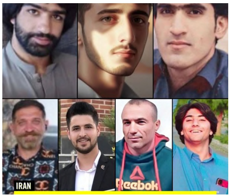
The seven protesters Amnesty says are in danger of execution