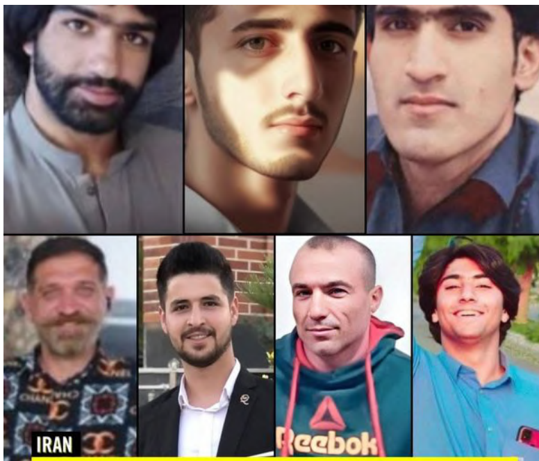
The seven protesters Amnesty says are in danger of execution