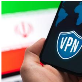
US State Department Providing VPNs For Iranians