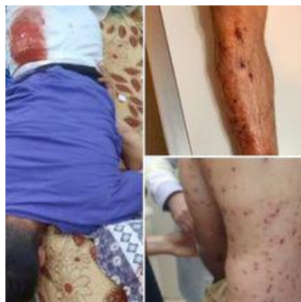
10 Injured In Nighttime Protests In Western Iran