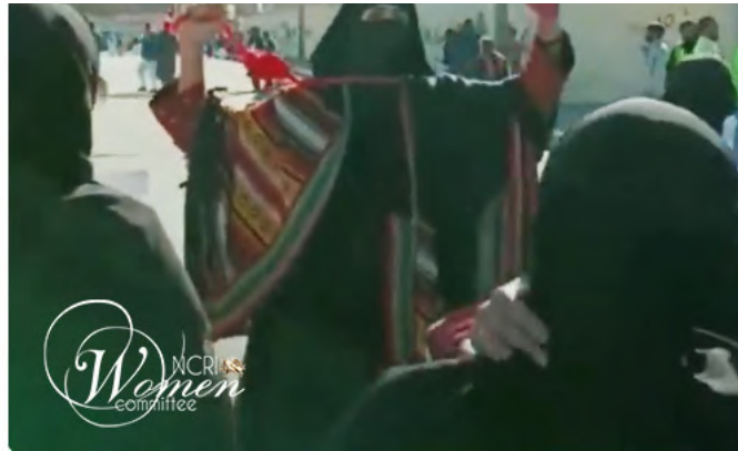
A Baluchi woman ties a noose around her neck in a symbolic protest to the execution of protesters