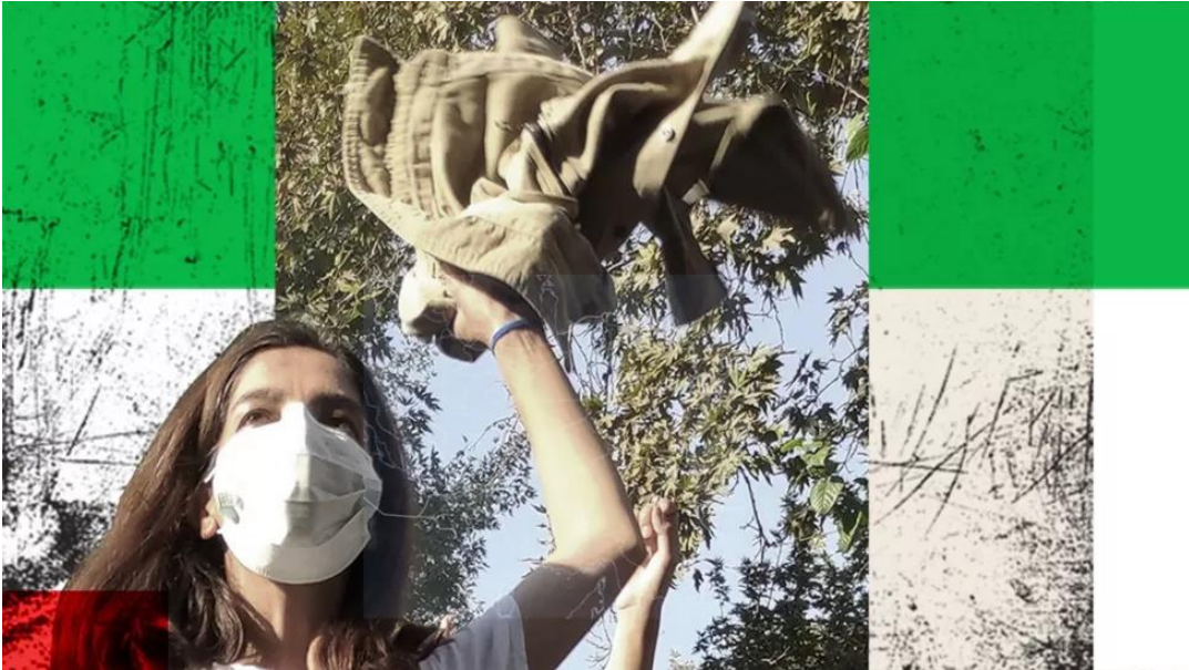
'I took off my hijab in front of police - we are winning'