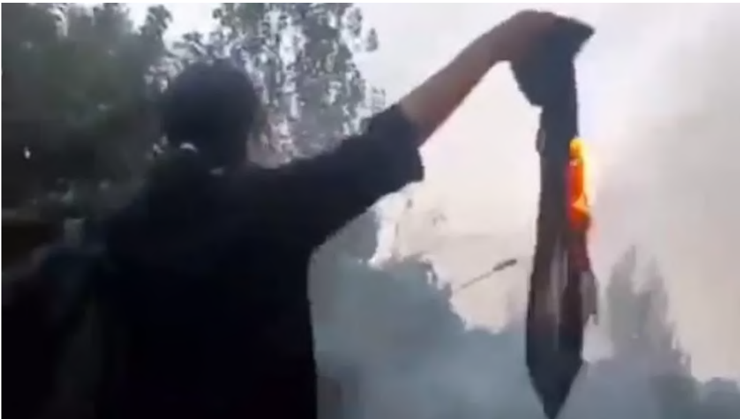
Videos show Iran teenager protesting before death