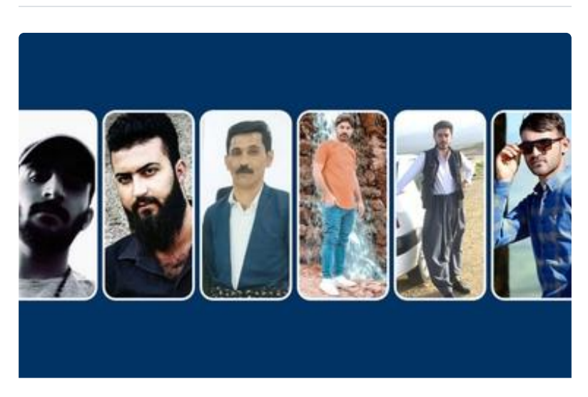
(L) 10:24 - 14 January 2023

In the evening of Saturday, November 19th, repressive forces attacked the apartments of Baharan town in Sanandaj and injured and arrested many people.