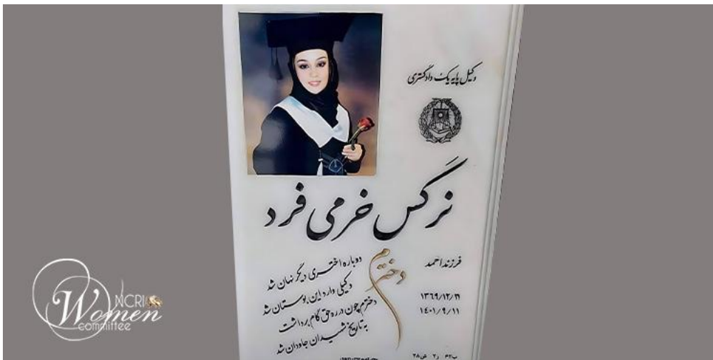
Tombstone of Narges Khorrami Fard in Mashhad's Behesht-e Reza Cemetery

The circumstances surrounding Narges' death were marred by intimidation as the hospital was surrounded by many security forces and vehicles belonging to the Special Guards Unit. The family was threatened to remain silent about Narges' death.