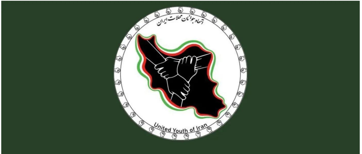
The logo of the United Youth of Iran