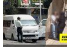
Tehran University students' sit-in protest

The students at Sharif University of Technology in Tehran held a rally, protesting the regime's expanding crackdown.