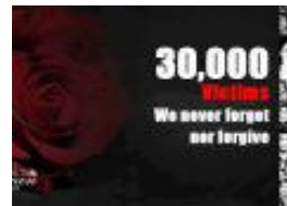
Sharif University on the 60th day of Iran uprising

The students at Sharif University of Technology in Tehran held a rally, protesting the regime's expanding crackdown.