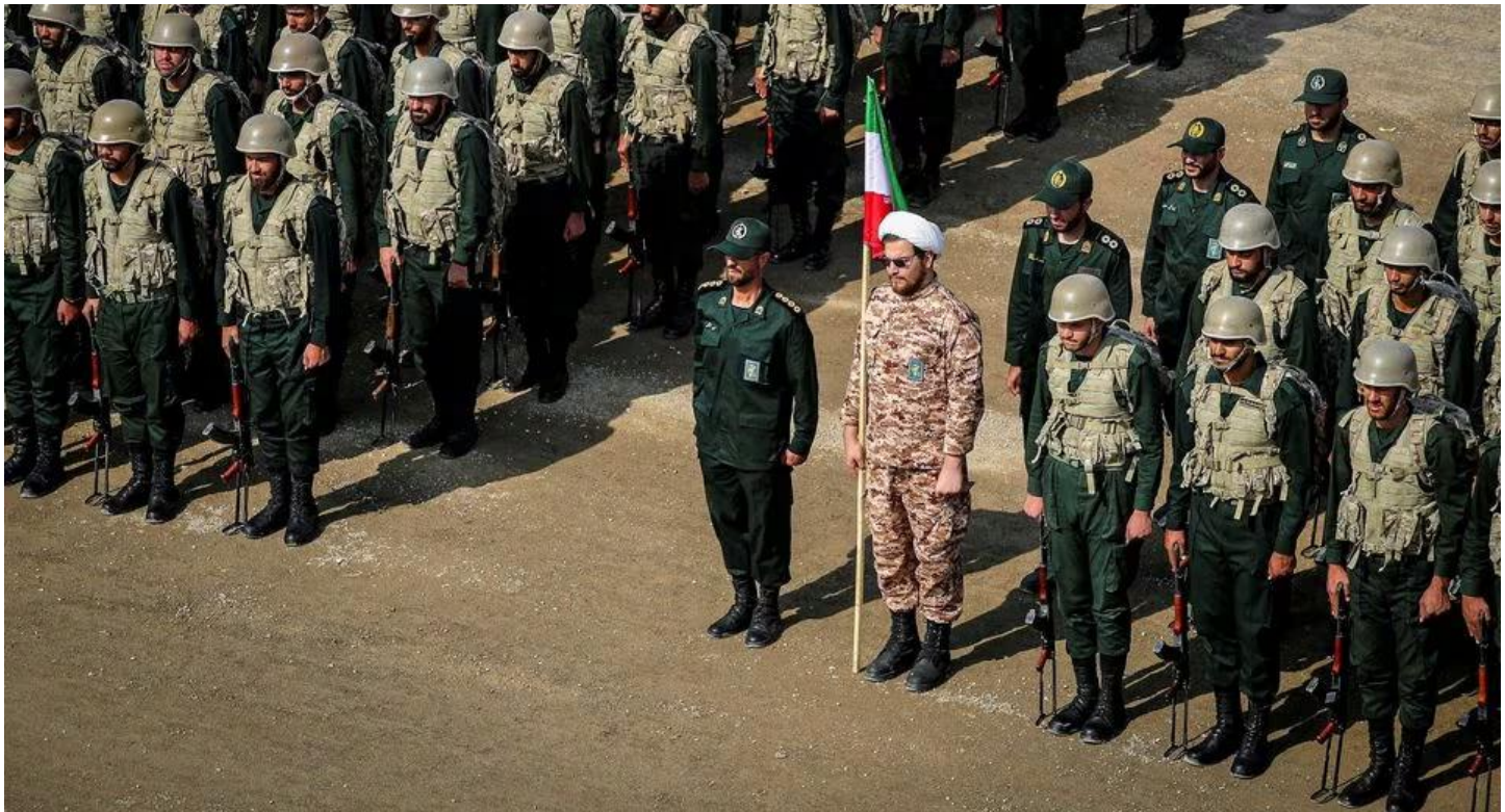
[1/2] Members of the Islamic Revolutionary Guard Corps (IRGC) attend an IRGC ground forces military drill in the Aras area, East Azerbaijan province, Iran, October 17, 2022.