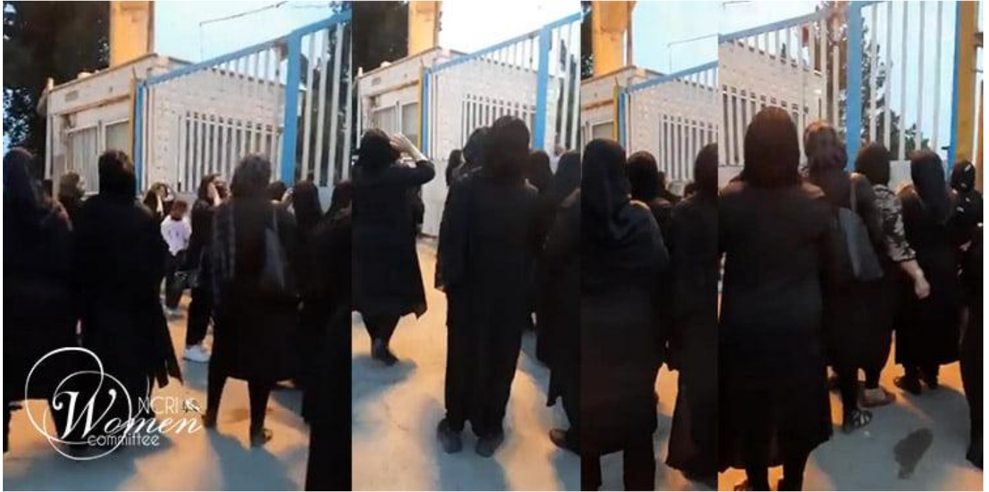
The protest gathering by families of death row prisoners gathered outside Qezel Hesar Prison