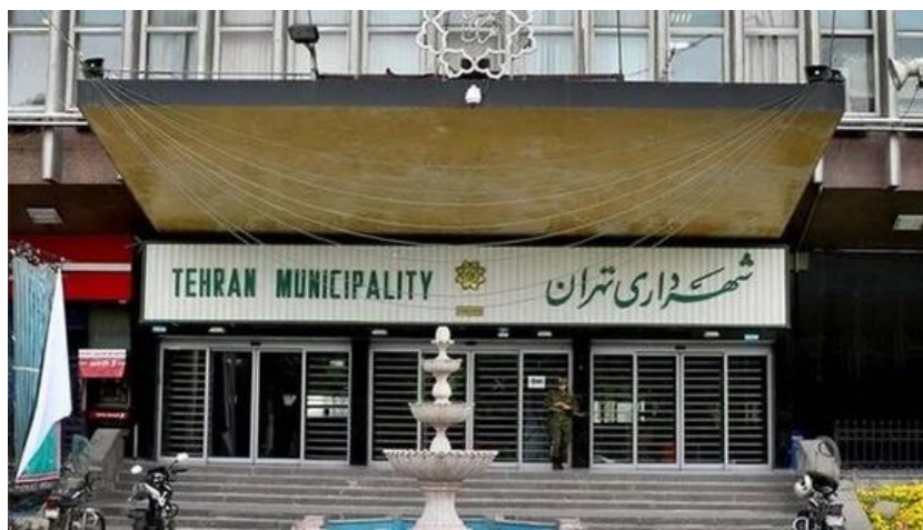
City Council Reports $400M Financial Irregularities In Tehran Municipality