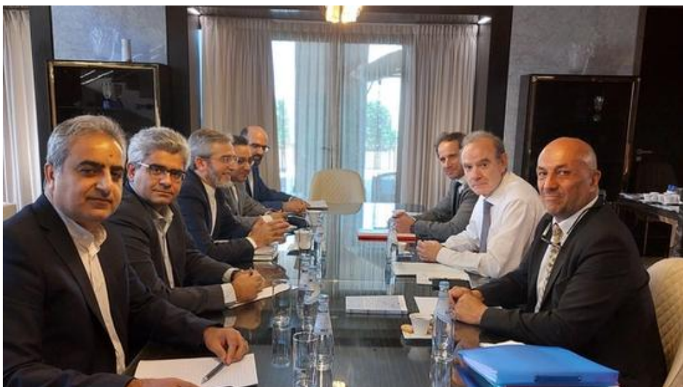
EU, Germany Under Fire For Talks With Iranian Regime