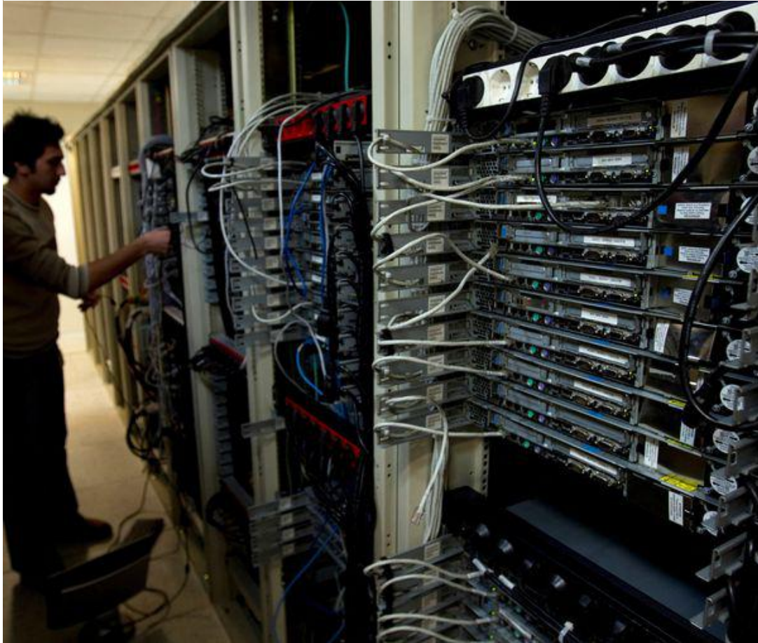
A computer engineer checks equipment at an internet service provider in Tehran February 15, 2011.