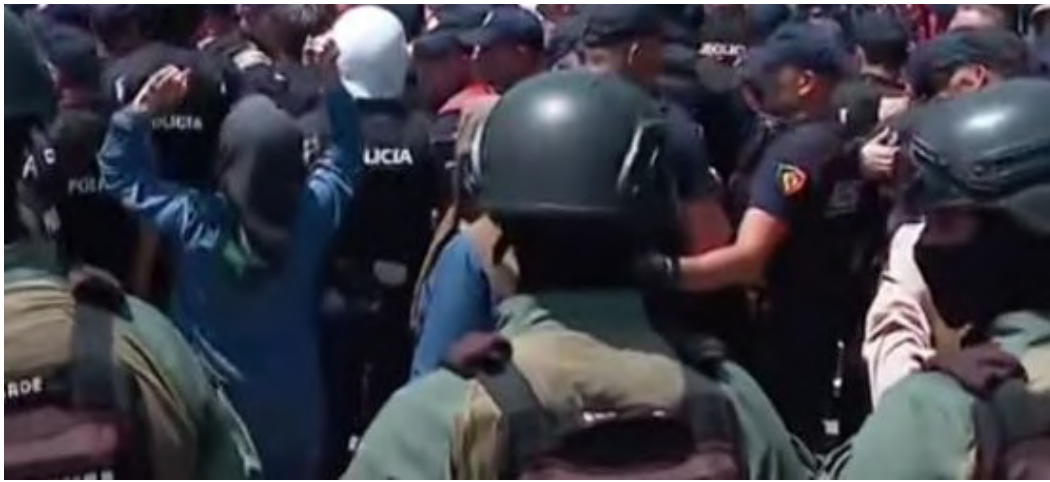
US Says Albania's Raid On Iranian MEK Compound Legal