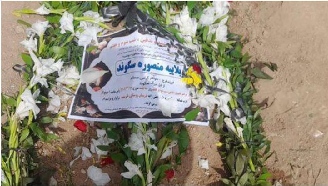
Funeral of Iranian Former Police Aide Held Amid Tight Security