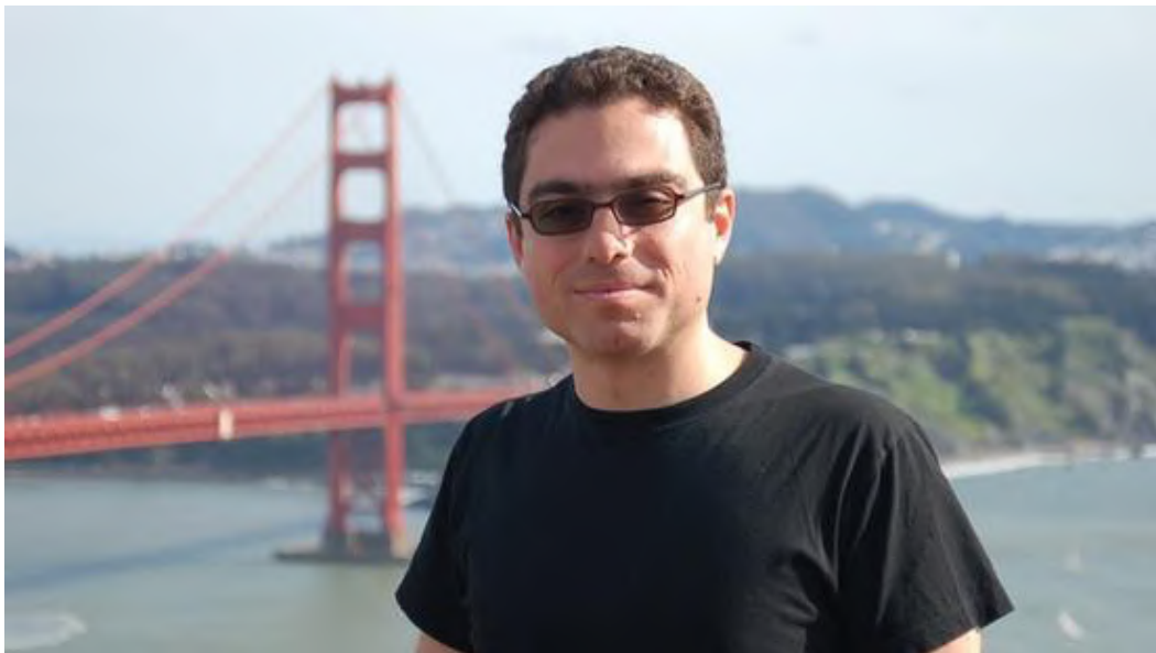
A US Hostage In Iran Reportedly Says He Will Be Freed Soon