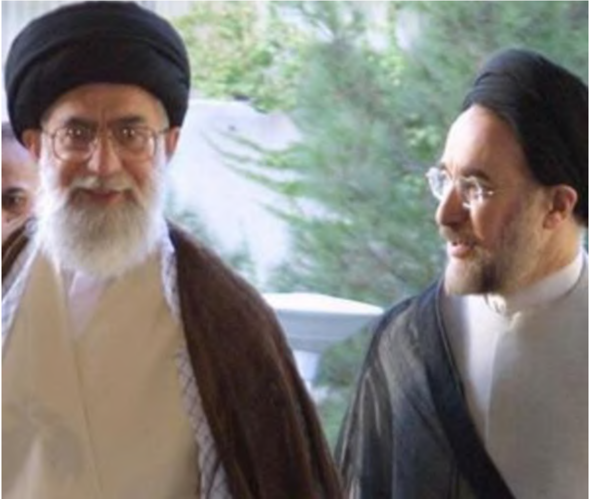
Former Iranian President Mohammad Khatami (right) and Supreme Leader Ali Khamenei