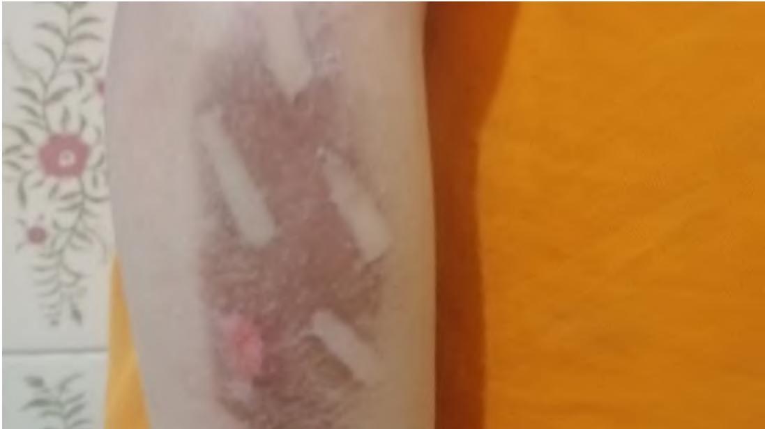
Authorities Seek To Silence Sources Who Revealed Torture Of Orphans