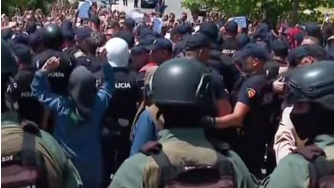
US Says Albania's Raid On Iranian MEK Compound Legal