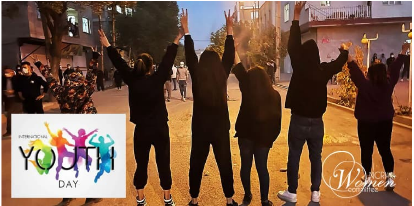
Iranian Youths' Unyielding Quest for Freedom