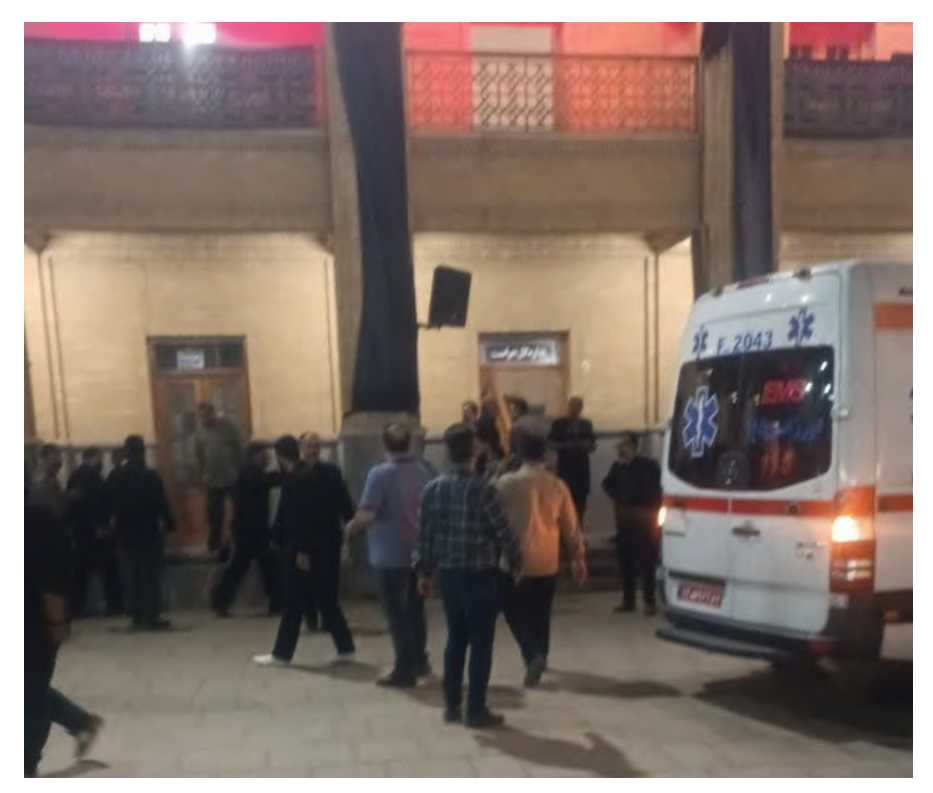
The aftermath of the attack on Shahcheragh funerary monument and mosque in Shiraz on August 13, 2023