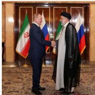
As Thick As Thieves? Russia Stops Fuel Supply To Iran