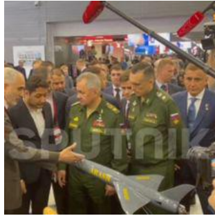
Russian Defense Minister Visits Iranian Military Stand at Army Expo