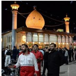
Questions And Tensions Mount In Wake Of Deadly Shrine Attack In Iran