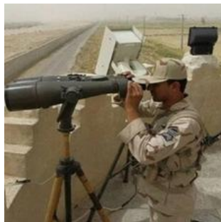
The Taliban Lay Claim To Stretch Of Iranian Border Area