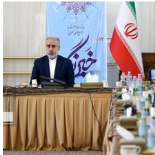
Iran Says Unfrozen S. Korean Funds Already In Europe