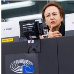
Nobel Peace Prize Laureate Ebadi Calls For Unity Against Iranian Regime