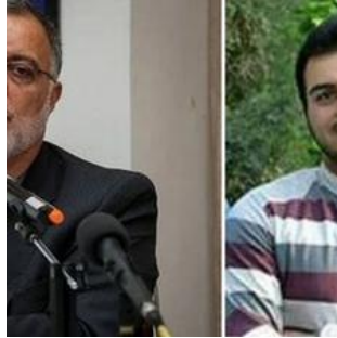
Tehran City Council Fed Up With Mayor's Nepotism