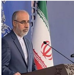
Iran Keeps Details Of Tehran-Washington Deal Under Wraps