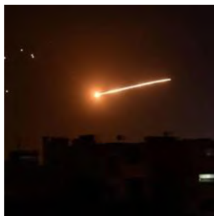
Israeli Strikes Target Iran-Backed Militia Missile Depots in Syria