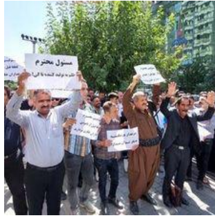
Iranian Poultry Farmers Protest Lack of Animal Feed