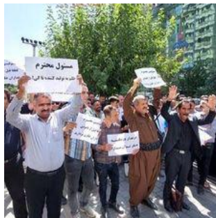
Iranian Poultry Farmers Protest Lack of Animal Feed