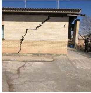
Schools Evacuated in Iran Due To Land Subsidence