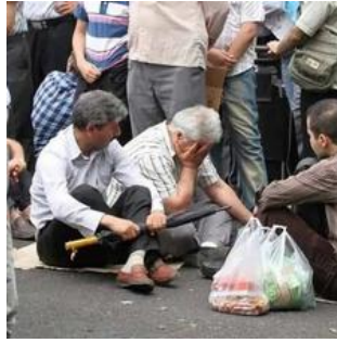
Iran Is Unwell, Says Conservative Newspaper