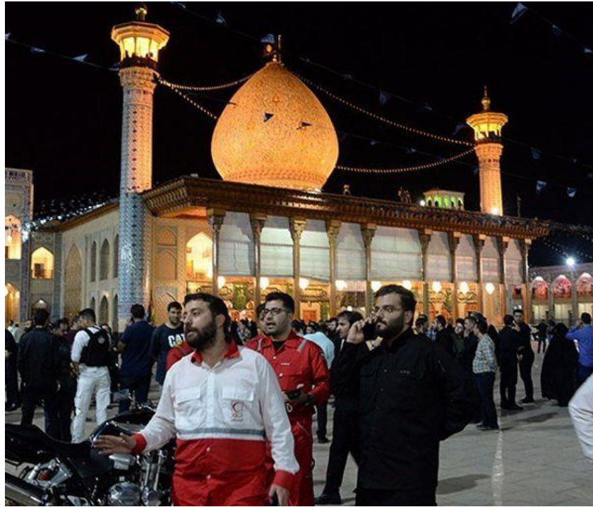
Aftermath of the attack on Shahcheragh funerary monument and mosque in Shiraz on August 13, 2023