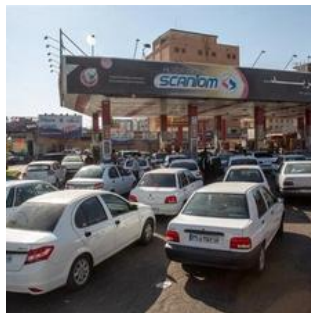
Iran Using Strategic Gasoline Reserves As Consumption Hits Record