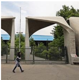
Purge Of Professors: Iran Axed Hundreds Of Academics In 17 Years