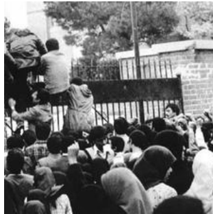
Former General Reveals IRGC's Role In US Embassy Takeover