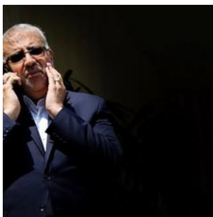
Gasoline Prices Remain Iranian Regime's Achilles Heel