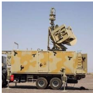
Iranian Army Launches 'Electronic Warfare' Drills