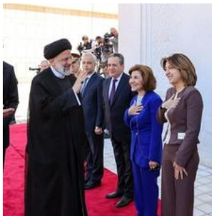
Iran Looks For Its Lost Billions In Syria