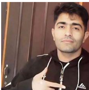
Young Protester Reportedly Killed In Armed Clash In Iran's South