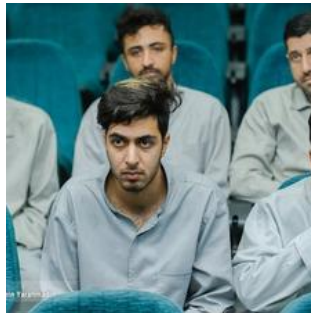
Watchdog Reveals Horrowing Details Of Detained Protesters Torture