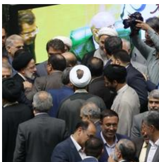
Iranian Lawmaker Calls For Raisi's Resignation Or No Second Term