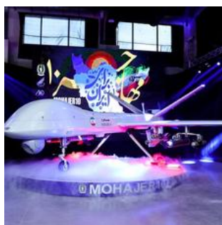
Iran Unveils New Upgraded Drone With Extended Range And Capabilities