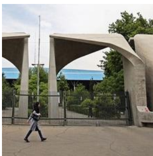
Purge Of Professors: Iran Axed Hundreds Of Academics In 17 Years