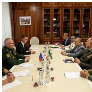
Russia, Iran Discuss Military Cooperation Amid Western Sanctions