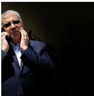
Gasoline Prices Remain Iranian Regime's Achilles Heel