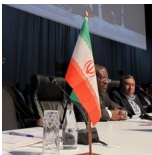
Iran Says Membership In BRICS Is Opposition To US