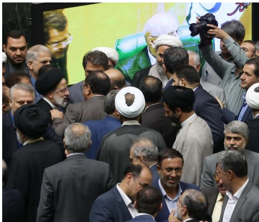
Iranian President Ebrahim Raisi among lawmakers at the parliament in June 2023