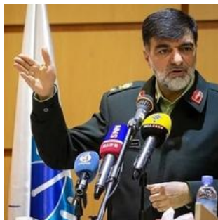
Iran's Police Chief Issues Stern Warning To Potential Protesters