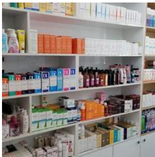
Chamber of Commerce: Iranian Healthcare Industry Faces Stark Future