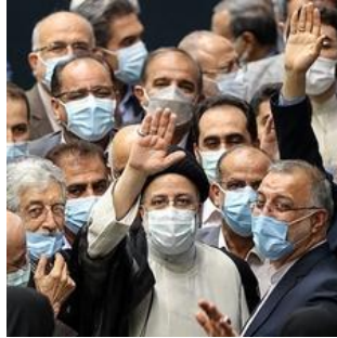
Iran's Ultraconservatives Gear Up To Win Parliamentary Elections