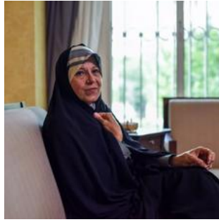
Jailed Presidential Daughter Urges Civil Disobedience In Iran