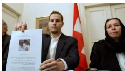
Families Of US Hostages Left Behind Plead For Help