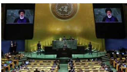
Iran's President In UN Claims Protests Were A Propaganda War