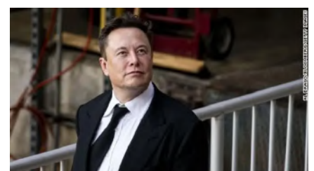
Elon Musk Reveals Iran's Dissatisfaction Over Starlink Launch