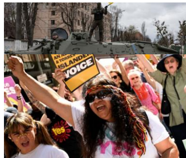
Indigenous rights vote is a reckoning for Australia