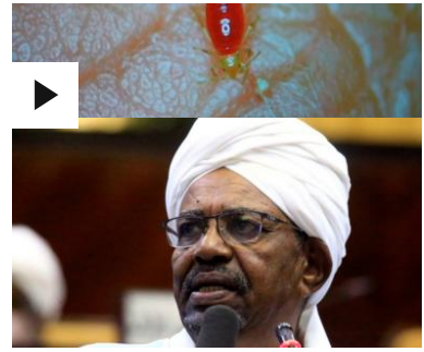
Voice cloning tech emerges in Sudan civil war

A year after Mahsa Amini's death, the protests have largely subsided. But sporadic demonstrations still take place and many girls and women have stopped covering their hair in public in open defiance of the dress code.