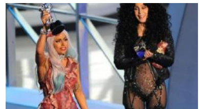
The dress that shocked the world