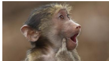
Kangaroos at play and proud gannet parents