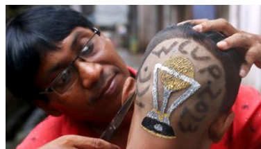
A quick guide to the 2023 Cricket World Cup