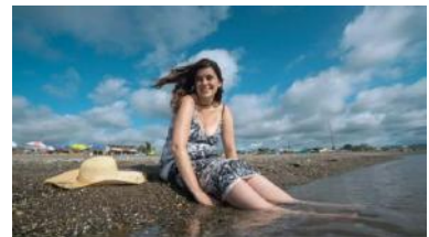
The companies paying for workers' holidays