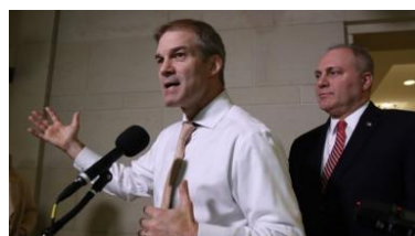
A deputy, an insider or Trump? The race for Speaker