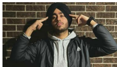
Hip-hop stars on edge as India-Canada row deepens