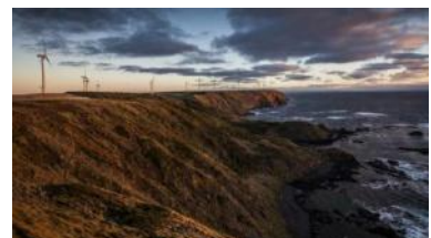
A place with air so clean it's bottled