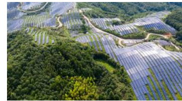
Discover why batteries are so important for growing reliance on renewable energy