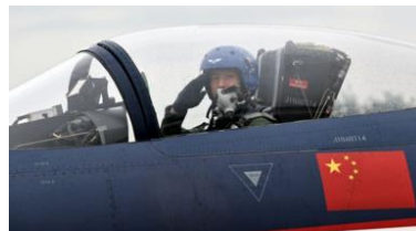
How China is fighting in the grey zone against Taiwan