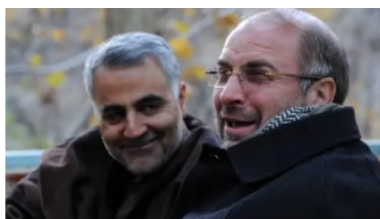
Iran Parliament Speaker Vows Support For Palestinian Groups