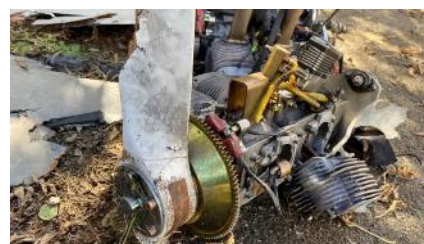
Russia Launches Large Air Attack With Iranian Drones