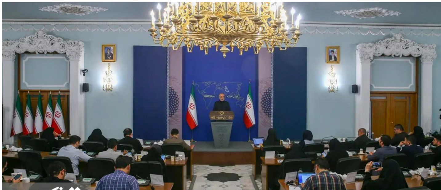
Iran's foreign ministry spokesperson Naser Kanaani during a press briefing session in Tehran