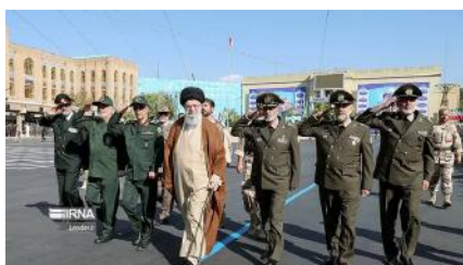
Iran's Khamenei Says Israel Has Suffered An Irreparable Defeat