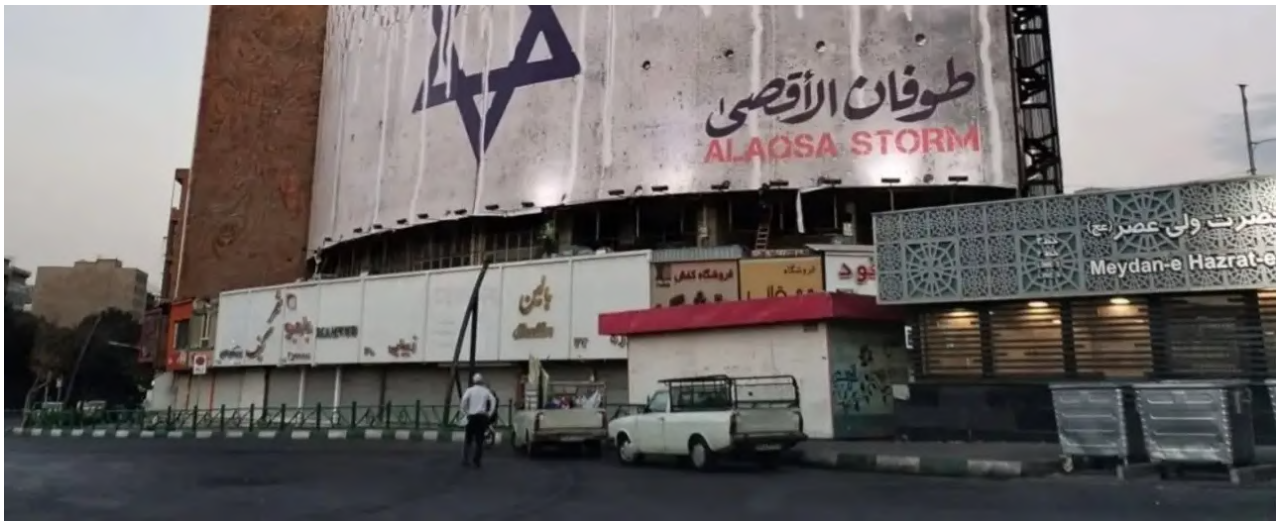
A mural at Tehran's Vali-Asr square in support of the attack on Israel, what Hamas calls "the operation al-Aqsa storm."

The Iranian regime signaled its support for Hamas, which is largely financed and armed by Tehran. Supreme Leader Ali Khamenei's social media, President Ebrahim Raisi and a host of other officials and the state media widely expressed their satisfaction with the attack the very first day.