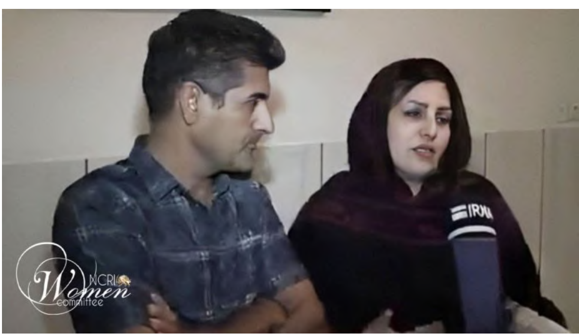
Armita's parents on the state TV

"Clearly, the regime has a specific scenario for covering up the truth about Armita, considering the experience of Zhina (Mahsa) Amini. Notably, the regime has evaded giving a clear answer even to the representatives and officials of the United Nations."