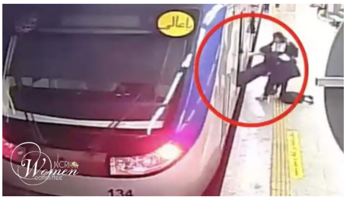
A scene from the regime's footage

The regime even changed her room and all the medical staff caring for her after a picture was leaked out of the hospital, presumably by one of the staff.