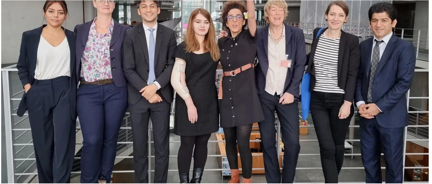
Iranian activist Masih Alinejad (5th left) in Berlin in November 2023