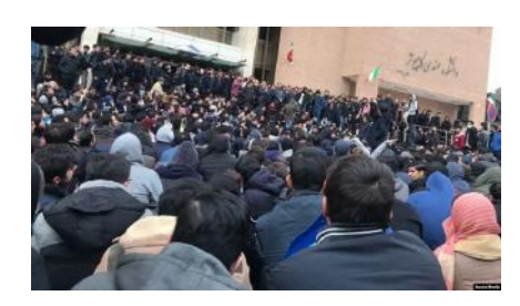
Crackdown, Bleak Prospects Force Iranian Students To Migrate Tuesday, 09/26/2023