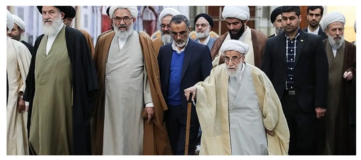
Members of Iran's Assembly of Experts led by Ayatollah Jannati