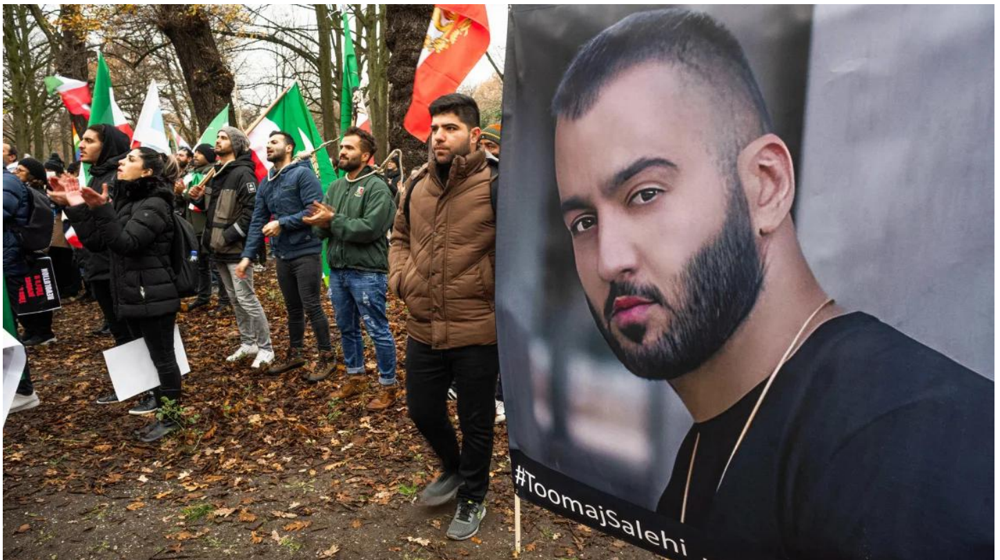
Protesters in support of Toomaj Salehi in The Hague, the Netherlands.

🕒 3 minute read · Updated 4:00 PM EDT, Sat May 4, 2024