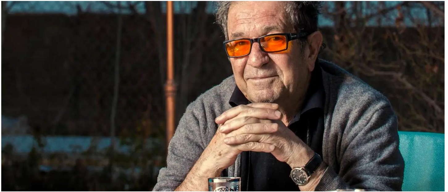
Iranian director Dariush Mehrjui