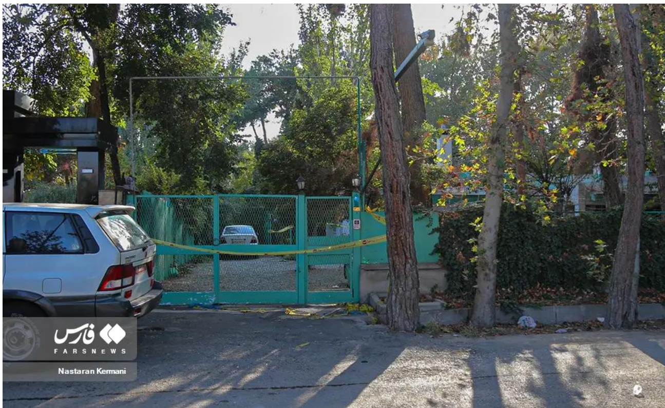
The country house where Iranian director Dariush Mehrjui and his wife were murdered

The ministry issued an unprecedented statement on January 4, 1999, which blamed "rogue" agents for four of the killings while calling the murders "despicable and abhorrent" and the minister, Ghorban-Ali Dorri-Najafabadi, favored by Khamenei who had still not consolidated his power as Supreme Leader, was replaced with the relatively moderate Ali Younesi.