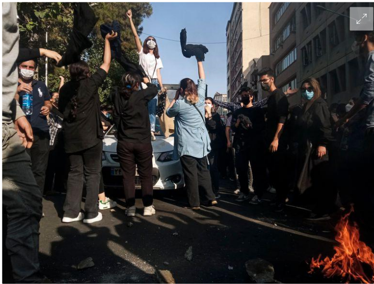
Demonstrators in Tehran: "Woman! Life! Freedom!"

It didn't take long for the spark to turn into a raging blaze. Tens of thousands joined the protests, with the marches continuing for several weeks. According to human rights organizations, at least 522 Iranians were killed by security forces, and more than 20,000 arrested, including many minors and girls. Young Iranians were demanding an end to the Islamic Republic, chanting things like "Death to the Dictator!" – referring to the aging Revolutionary Leader Ali Khamenei, who has ruled the country for the last 34 years.