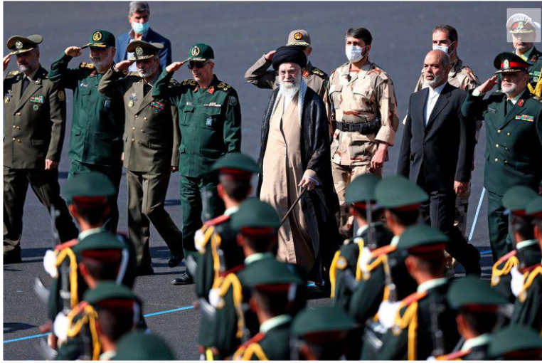
Supreme Leader Ali Khamenei and other Iranian leaders during a visit to the police academy in Tehran in October 2022.

How, though, does this equation – with the dwindling number of defenders of the Islamic Republic on the one hand, and the steadily growing opposition, on the other – work on long term? Many children of the wealthy study outside of Iran in some of the world's best universities. And most assets are invested internationally.