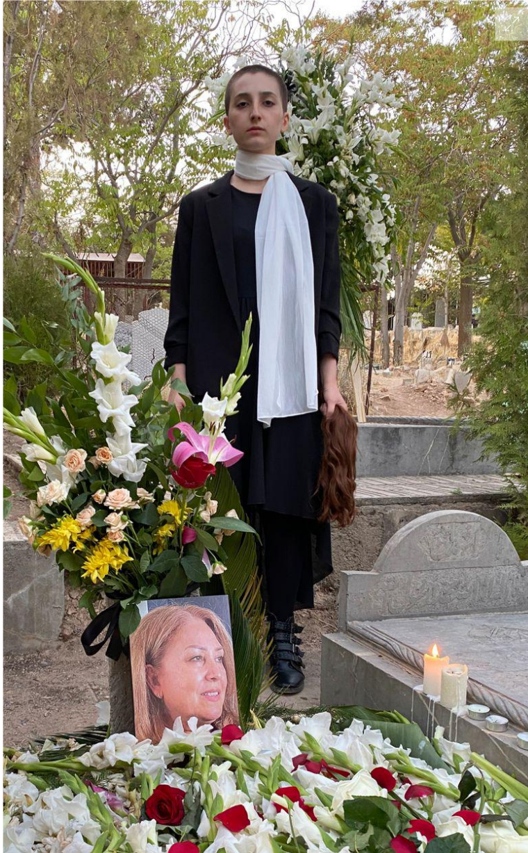
Roya Piraei at her mother's grave. This image went viral and led to Piraei fleeing into exile.

The photo was taken in fall 2022 and it immediately went viral. Women around the world, inspired by Piraei, then 24, cut off their hair to show solidarity with the protests in Iran – with the country's Generation Z as it fought desperately for its future only to be continually beat down. It is a photo that continues to inspire artists and authors today. In 2022, the BBC included Piraei on its 100 list of inspiring and influential women.