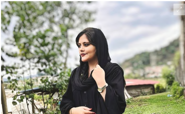
Jina Mahsa Amini's death was the spark that unleashed the most recent wave of protests in Iran.