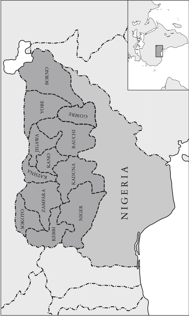
Map 3. The spread of Shari' criminal law in Nigeria (dark grey)