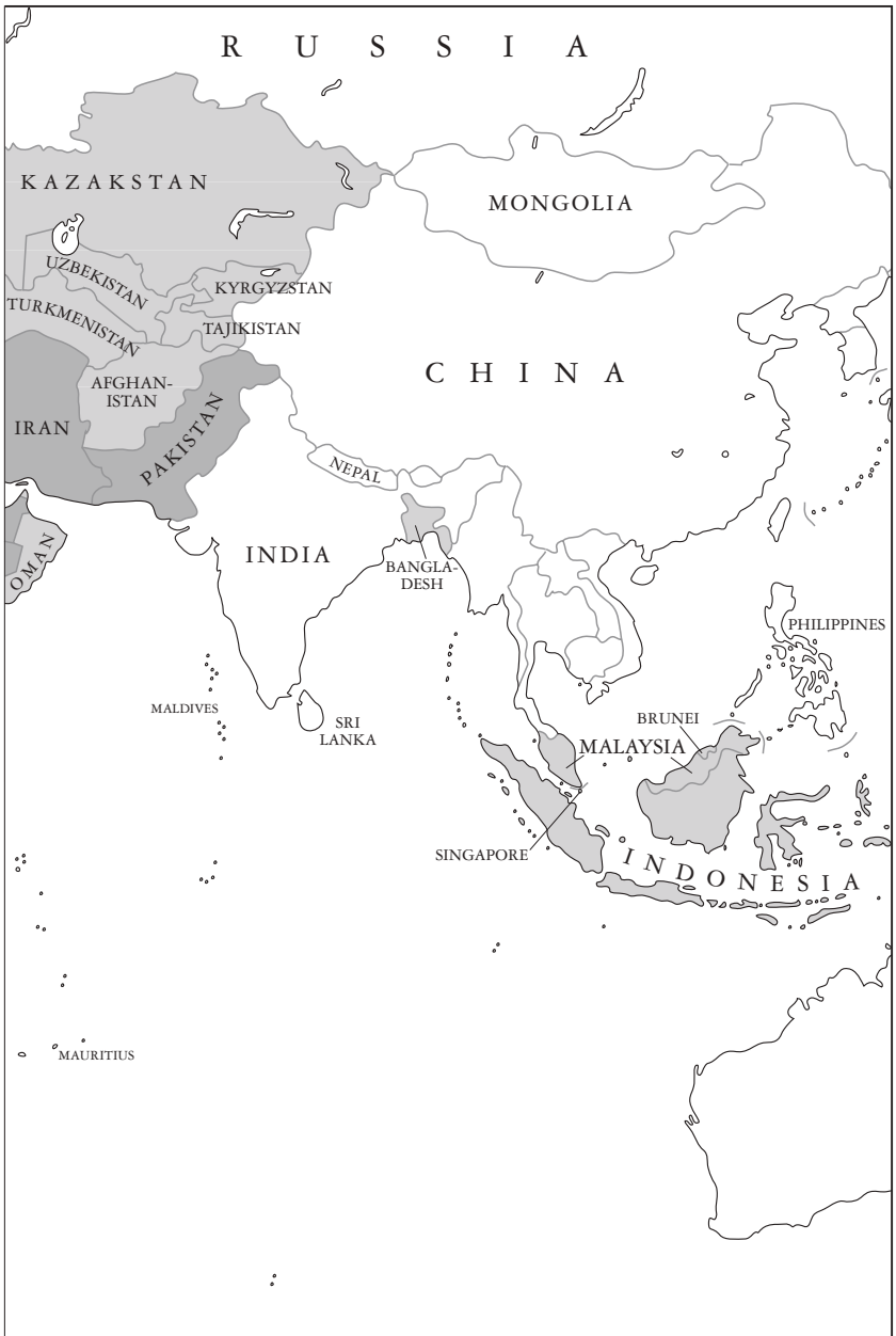
Map 2. (cont.)