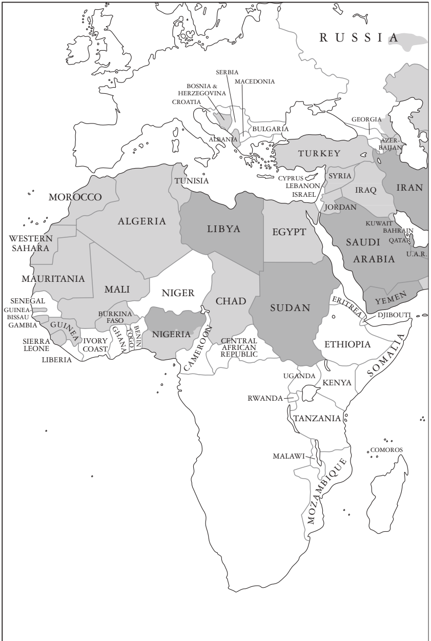
Map 2. Countries implementing Shari'ah criminal law (dark grey)